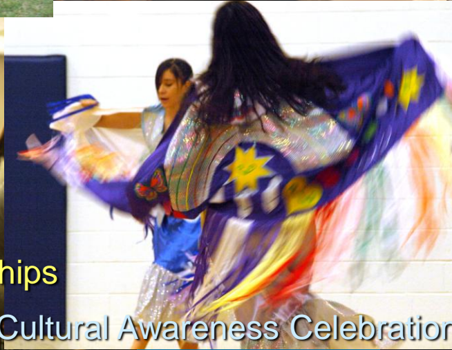
Cultural Awareness Celebrations