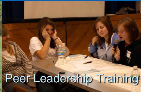
Peer Leadership Training