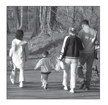
Illinois Children's Mental Health Partnership Guidelines for School-Community Partnerships: Addressing the Unmet Mental Health Needs of School Age Children